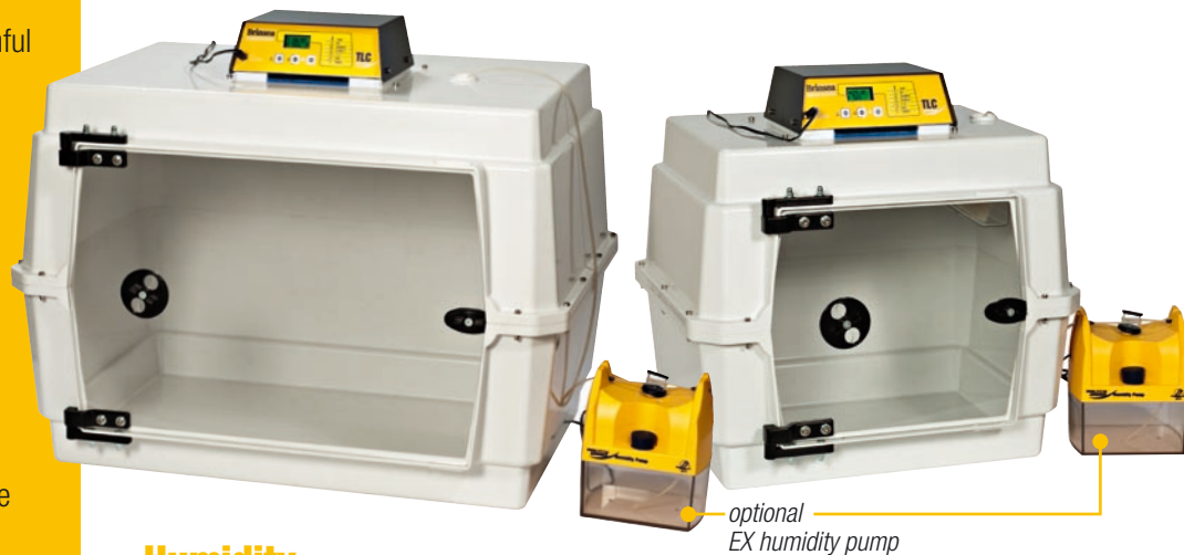
optional EX humidity pump