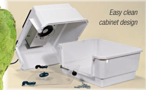
Easy clean cabinet design