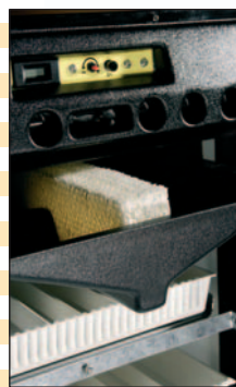
Integral water tray and airflow control