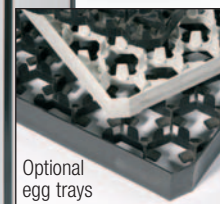
Optional egg trays