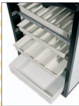
Universal Egg Trays and Hatching Tray