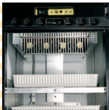
Fans provide 'Laminar Airflow'