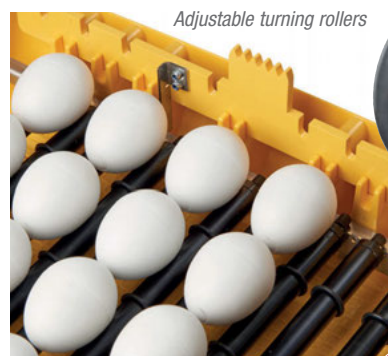
Adjustable turning rollers

Brinsea's Induced Dual Airflow system represents a breakthrough in incubator design and achieves new levels of temperature consistency for optimum incubation conditions.